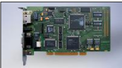
DF PROFI II PCI

COMSOFT FDT 1.2 Communication DTM The available FDT 1.2 Communication DTM allows the use of the DF PROFI II board within any FDT 1.2 capable container programs for DP Slave configuration. FDT container programs are included in many process control systems. They are also available as stand-alone solutions, e.g. Pactware of the Pactware Association.