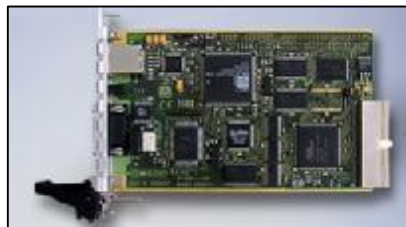
DF PROFI II CPCI