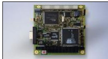
DF PROFI II PC104+