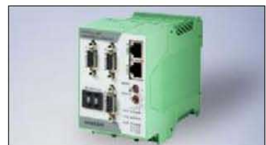
PRS – PROFIBUS DP Redundancy Switch

PRS also allows the realization of very complex redundancy systems, i.e. in connection with PROFIBUS OPC servers or overlying Ethernet based cell networks.