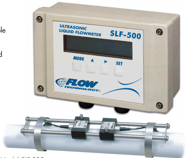
Model SLF-500 Ultrasonic Liquid Flow Meter